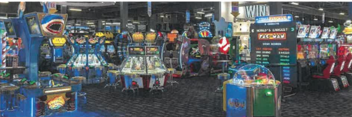
GAMES IN A LARGE SCALE FACILITY (EX. DAVE AND BUSTERS)