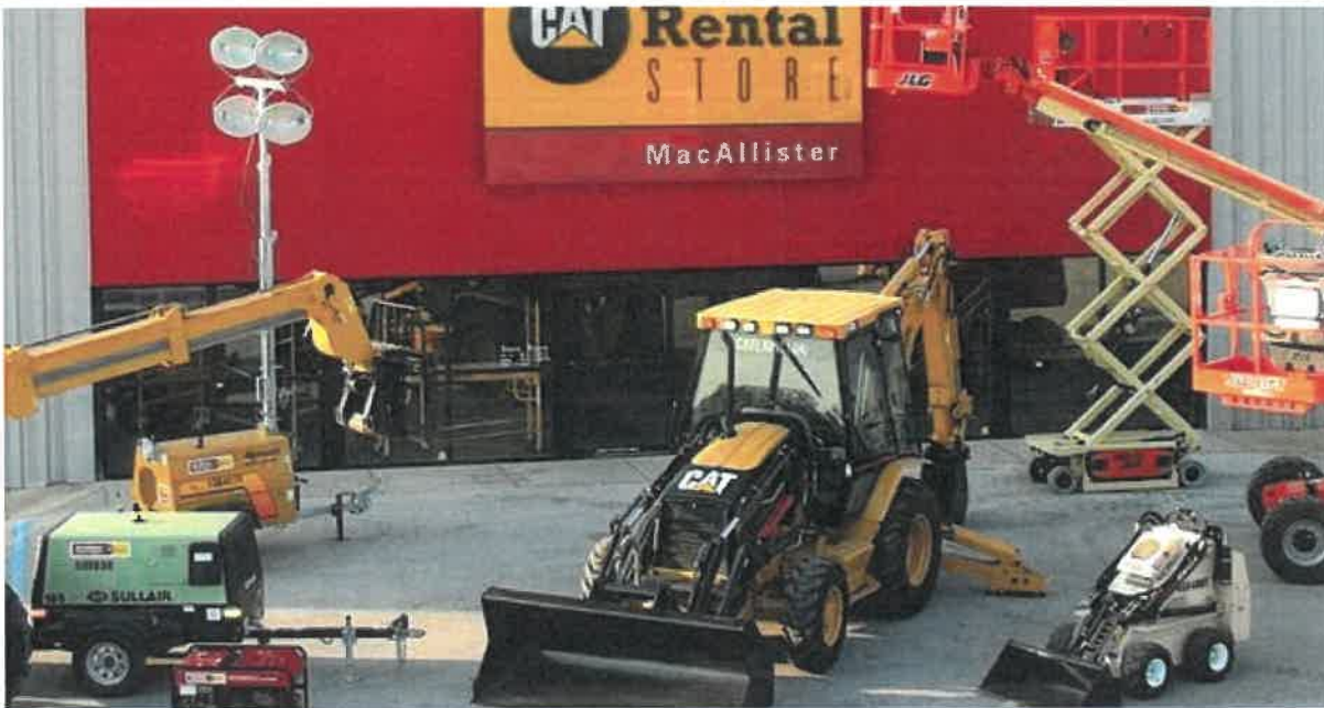
DIFFERENT TYPES OF VEHICLE OR EQUIPMENT RENTAL