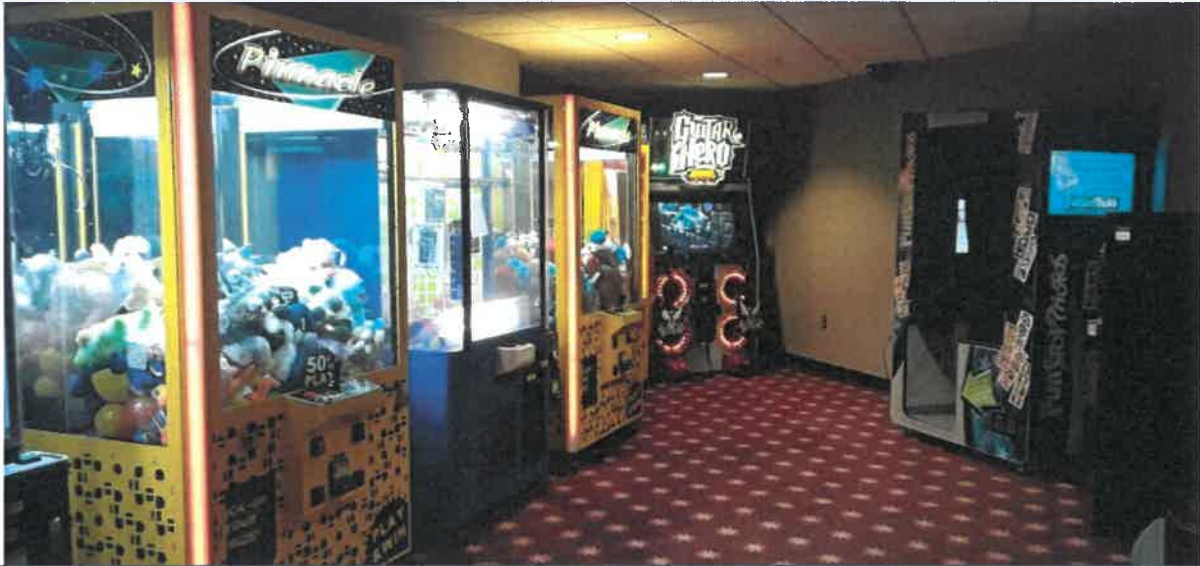
GAMES IN MOVIE THEATERS