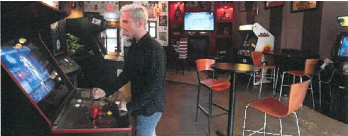
GAMES IN BAR/RESTAURANT