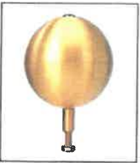
BAL-0612-GLD HD Gold Anodized Aluminum Ball