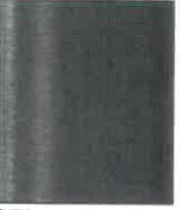
ABL Black Anodized