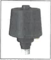
TRK-9650-BLK Int. Revolving Truck Sealed Bearings