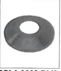
COL1-A06S-BLK FC-11 Spun Alum 1-Piece