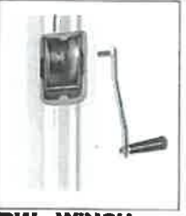
IRW - WINCH Reinforced Welded Door Frame

NOTE: Flagpole Components on Anodized and Powder Coat flagpoles (excluding specified Ornaments and Ball Trucks) will match flagpole color specified.