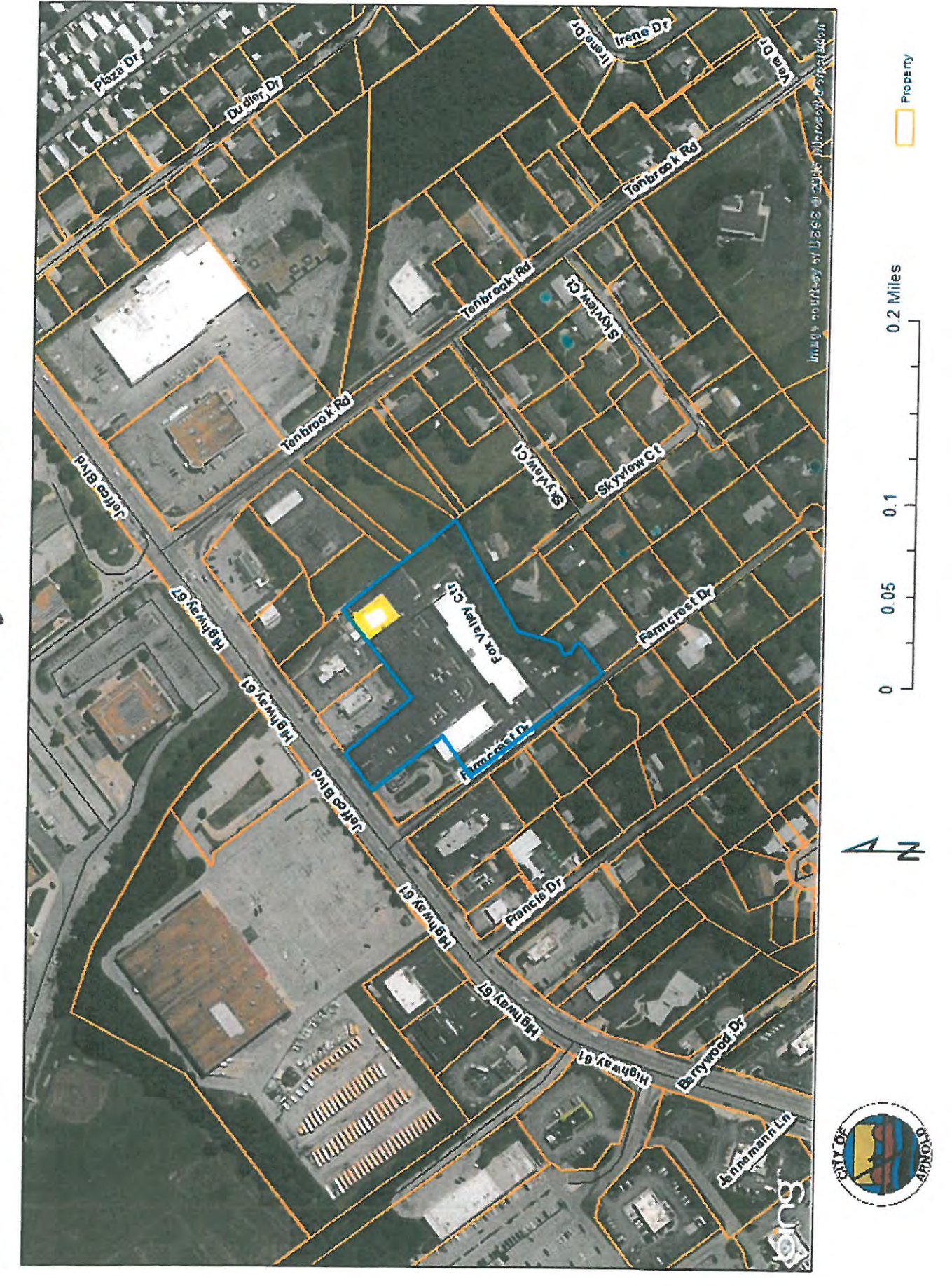
39 Fox Valley Center